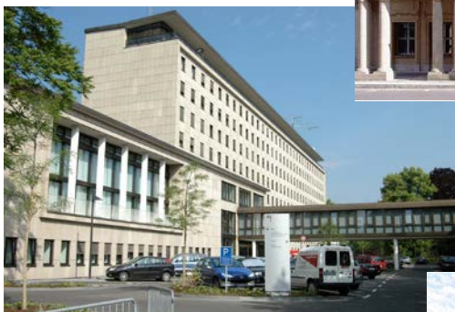
Adenauerallee 99–103, Bonn