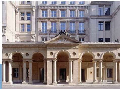
Mohrenstrasse 37, Berlin